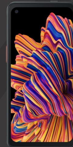
Galaxy XCover Pro