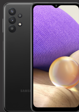
Galaxy A52 5G Enterprise Edition