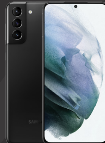
Galaxy S21 Ultra 5G